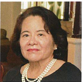
H.E. Mrs. Sandra Marie Granger First Lady of the Republic of Guyana

His career as Congressman includes service in the comissions of Economic Planning, Public Debt Management, and the Modernization and Reform of the Dominican State.