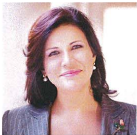
H.E. Dr. Margarita Cedeño de Fernández Vice President of the Dominican Republic

A Juris Doctor from Universidad Autónoma de Santo Domingo (UASD), and post-graduate studies in Business Law and Economic Legislation, and Political Science for Development (Universidad de Salamanca).