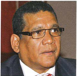
Hon. Rubén D. Maldonado Díaz President, Cámara de Diputados, National Congress of the Dominican Republic

She has devoted most of her political career to the promotion of women's rights. She leads a strategy to bring families out of poverty based on social programs for the benefit of women, the youth, the elderly and the disabled, under the umbrella of a broad social initiatives program known as Progresando con Solidaridad (PROSOLI).